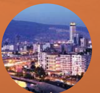
Images above, top to bottom: