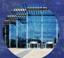
Images above, top to bottom: