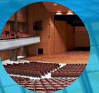
Images above, top to bottom: