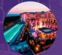
Images above, top to bottom: