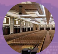
Images above, top to bottom: